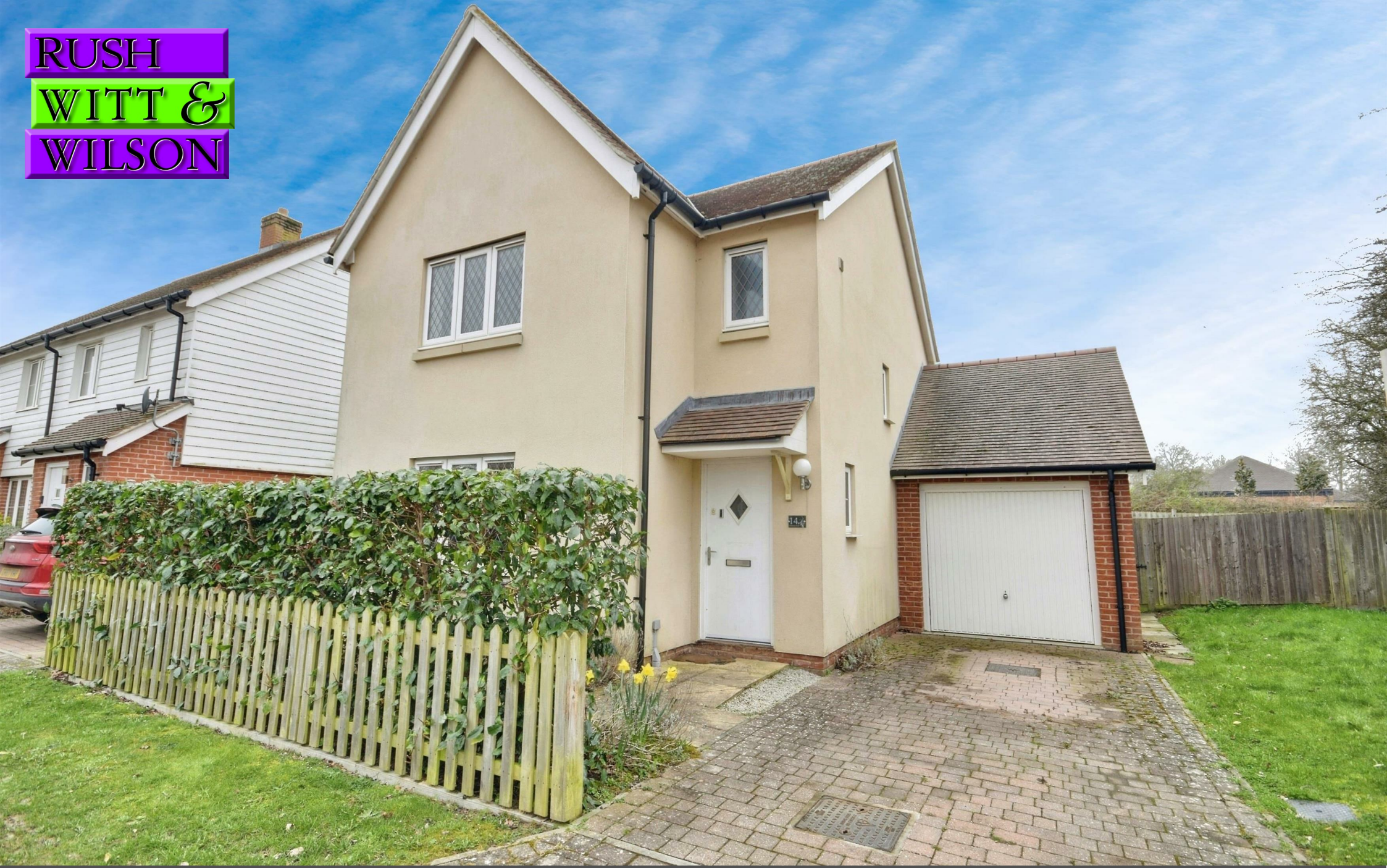
14 Cricketers Field, Northiam, East Sussex, TN31 6FA. £400,000 - £425,000 Guide Price Freehold